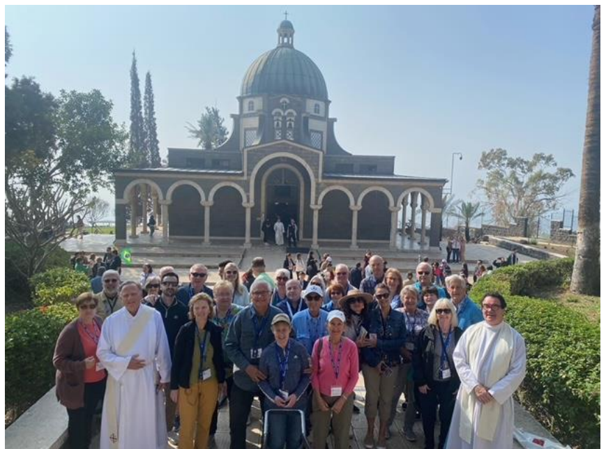
Just finishing Mass at the Mt of Beatitudes