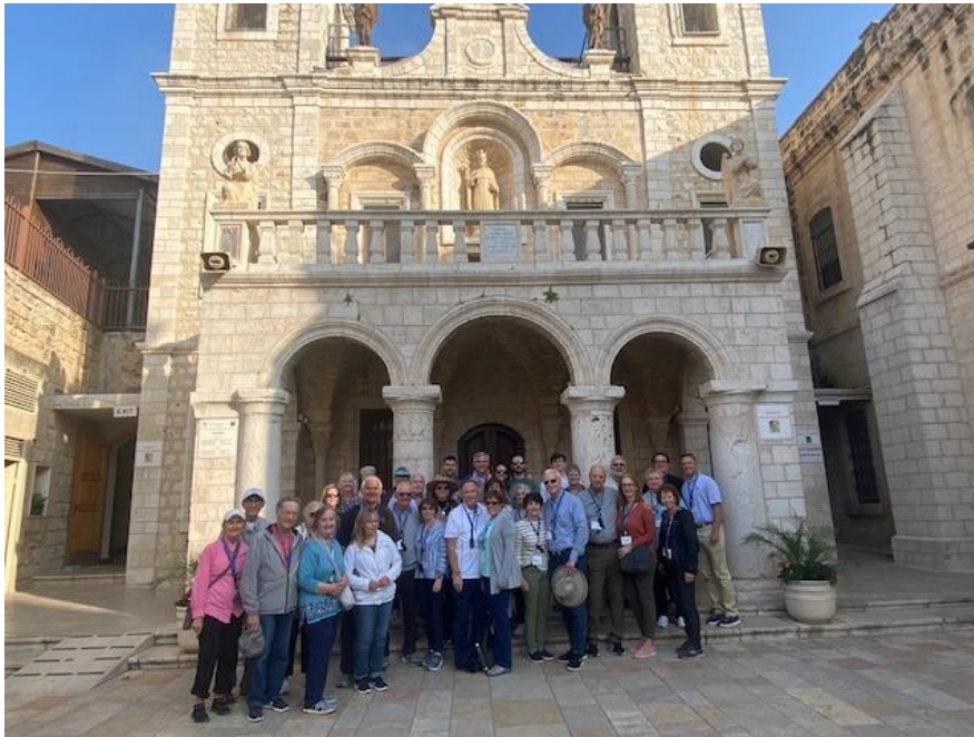
PBOC Team at Cana in Galilee