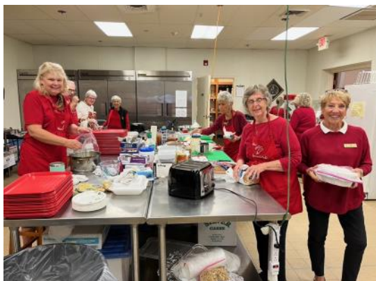
Arts & Crafts Festival