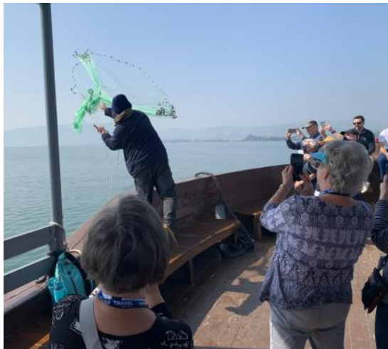
Learning to fish in the Sea of Galilee