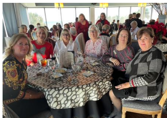
Christmas Luncheon at Ocean One