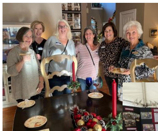
Sip 'N Chat