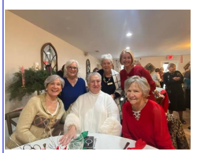
Christmas Luncheon at Tap & Pour

Our annual Arts & Crafts Festival was a rousing success, featuring 63 Crafters, a used Book Sale, Bake Sale, Kitchen Café – providing breakfast and lunch for sale over the two-day event and the Kitchen Cupboard selling frozen prepared meals such as Quiches, Soups and Casseroles.