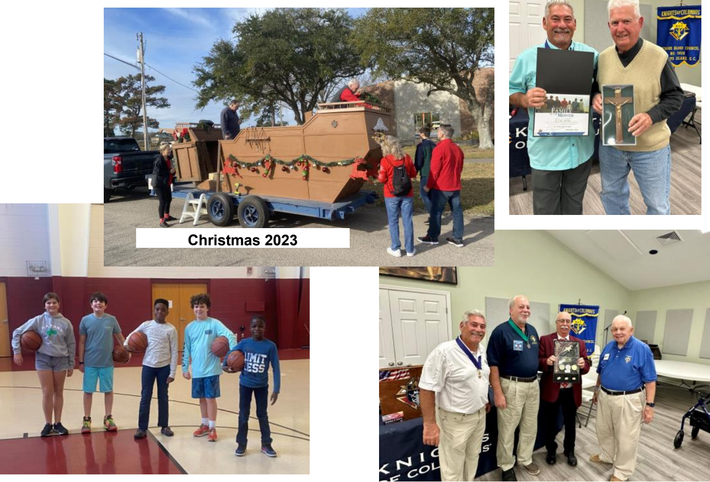
Basketball Free Throw