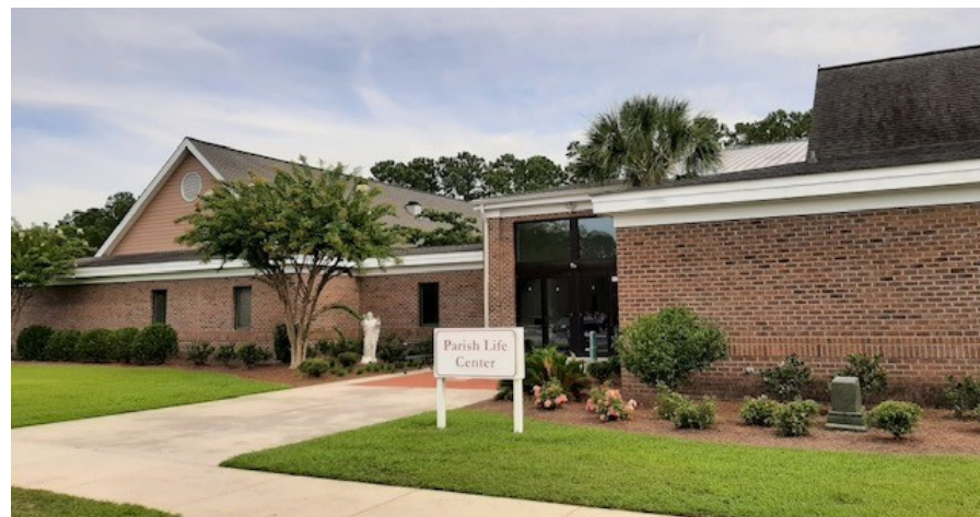
PARISH LIFE CENTER Parish Offices Religious Education Classrooms Parish Fellowship Hall

The Parish council's function is to give the Pastor and ministry Chairpersons information in their specific areas of responsibility. The Council is comprised of the Chairpersons of the seven major ministries at PBOC. In addition 4 representatives are elected from the parishioners, 3 adult and 1 young adult. The council is chaired by the Pastor and co-chaired by the Parish Coordinator. The council members' terms run in parallel with their term in their respective ministry. The elected members serve for a period of two years. The council meets bi-monthly.