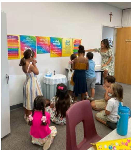
The 2nd grade First Communion prep class learning their prayers.