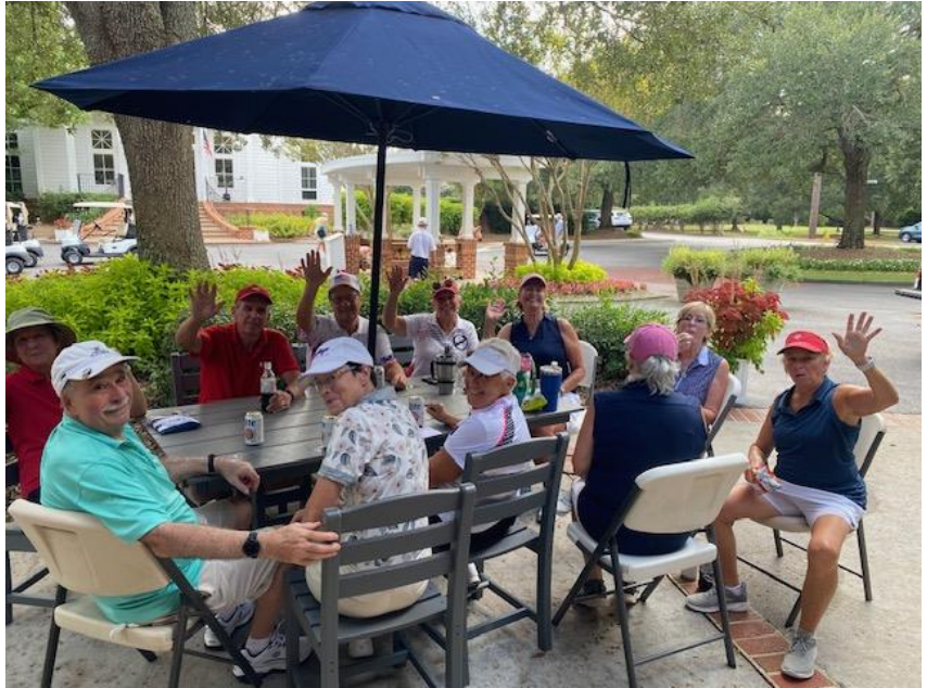
2923 Golf Tournament at The Reserve