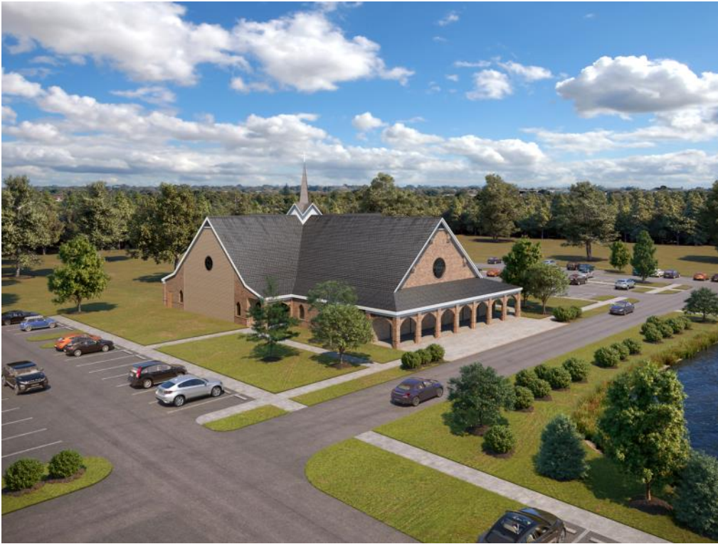
Before Church expansion