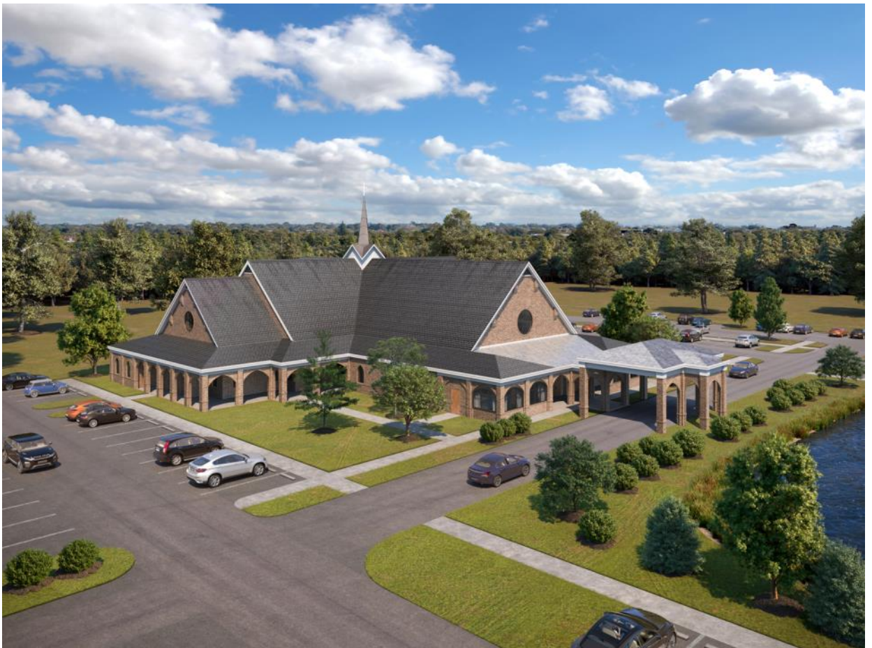
After Church expansion