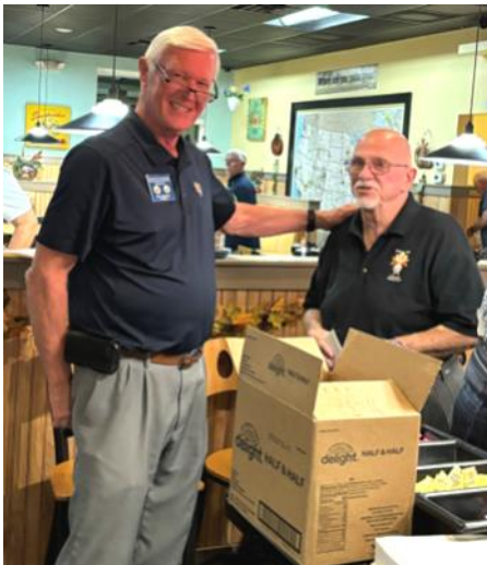
Pancake Supper at Eggs Up Grill

Last year we donated approximately $40,000. We place a special emphasis on helping the unborn, the hungry, the homeless, and those born with physical and mental challenges. The Knights of Columbus supports Life from conception to natural death.