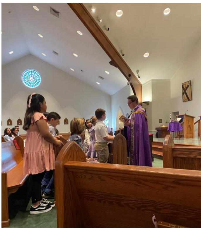
First Reconciliation in preparation for First Holy Communion on May 4