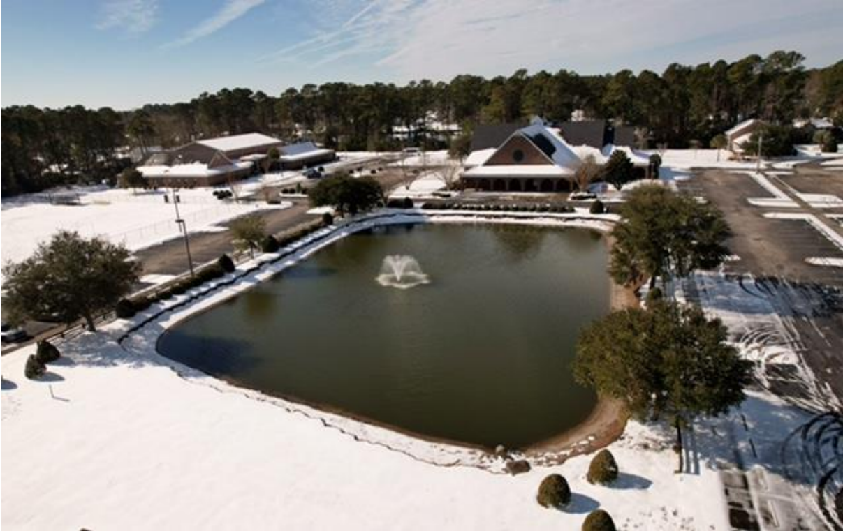
“God’s playing tricks on us!” Winter Snowstorm , January 22, 2025